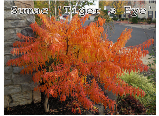
Sumac 'Tiger's Eye'