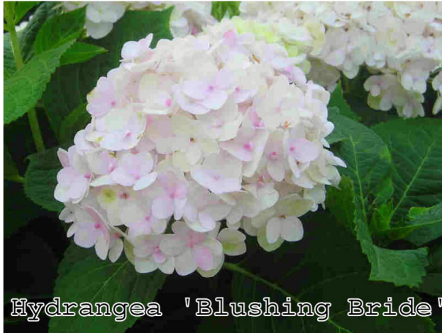
Hydrangea 'Blushing Bride'