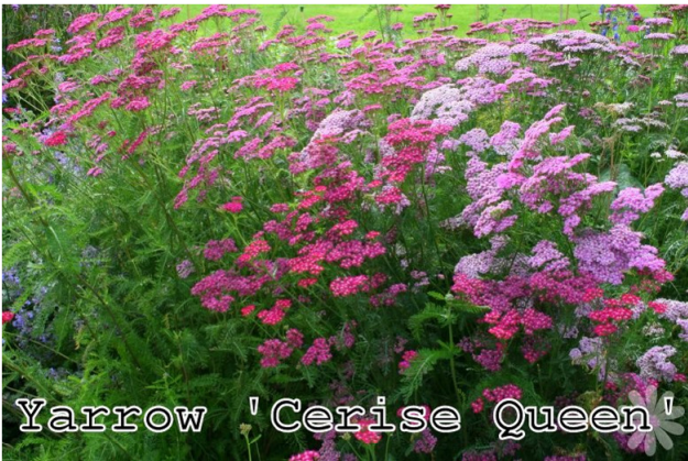
Yarrow 'Cerise Queen'