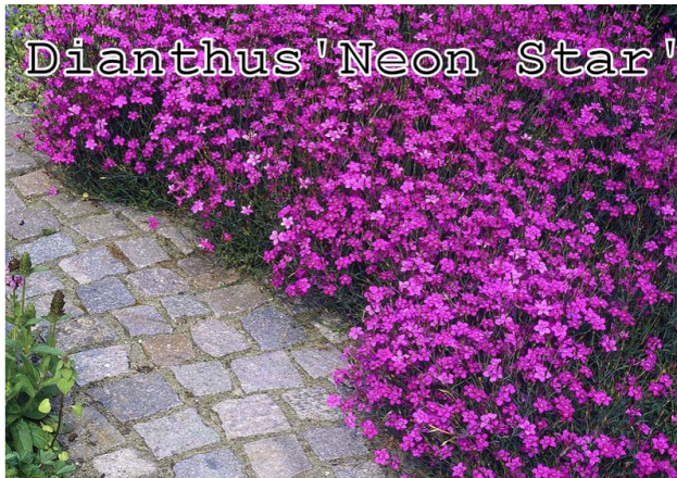
Dianthus 'Neon Star'