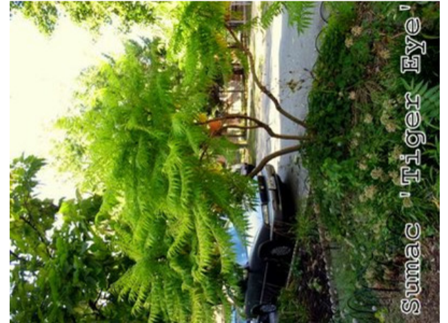
Sumac 'Tiger Eye'