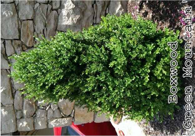
Boxwood 'Green Mountain'