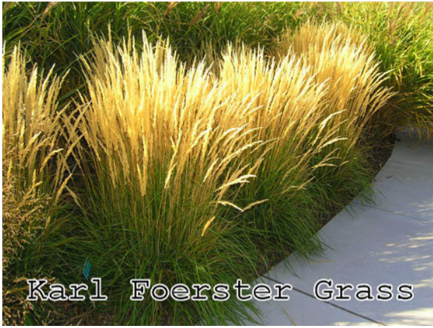
Karl Foerster Grass