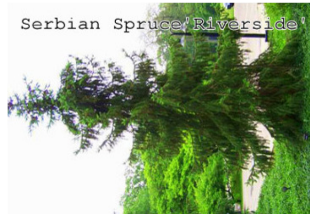
Serbian Spruce 'Riverside'